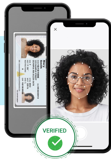
SELFIE + DOCUMENT AGE VERIFY