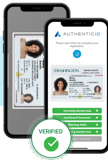
DOCUMENT AGE VERIFY